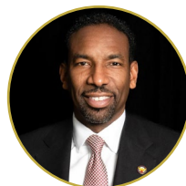
The Honorable Andre Dickens