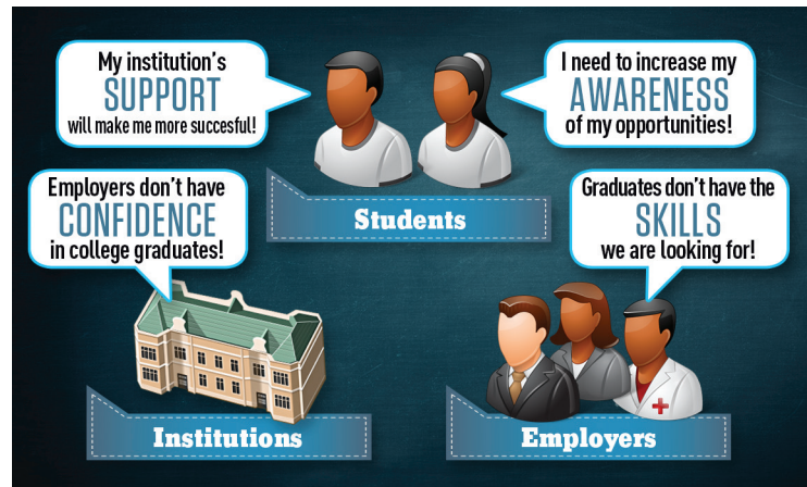
Figure 1. Gaps that must be addressed to develop career pathways that lead to greater economic success.

But despite the advantages of producing more college graduates, the U.S. continues to fall short. According to the Census Bureau, 32.5 percent of the population