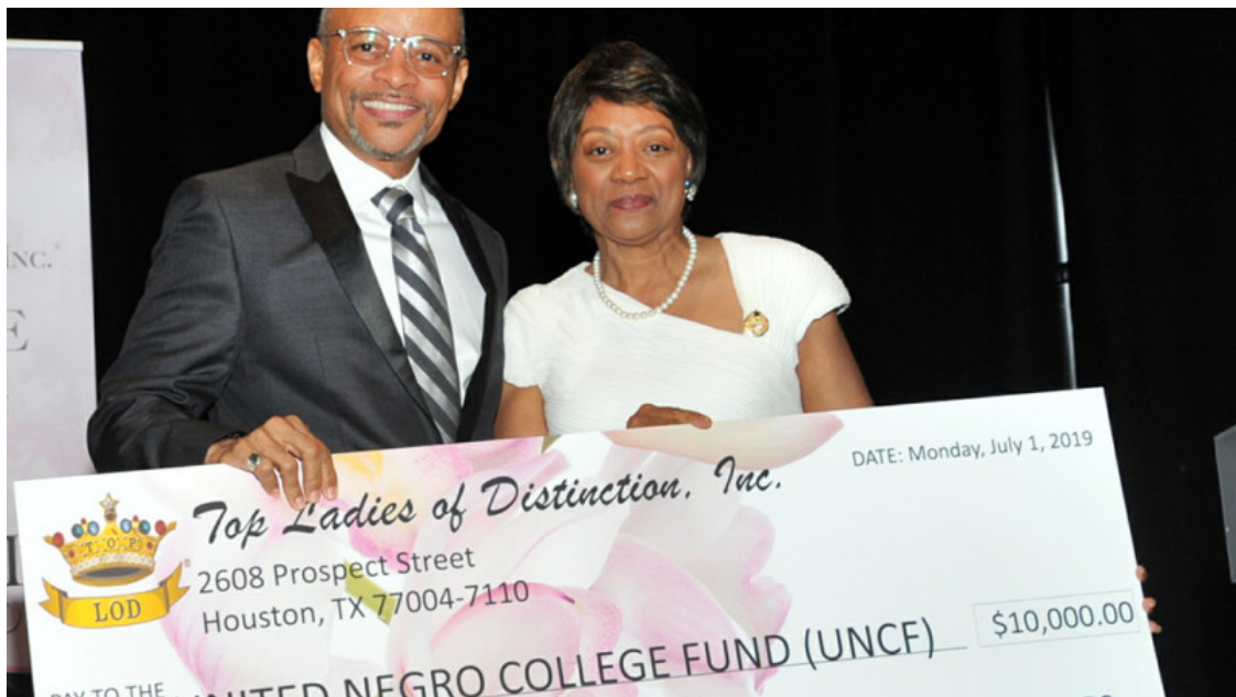
TOP LADIES OF DISTINCTION, INC., IS PROUD TO WORK WITH UNCF ON ITS WORKPLACE INITIATIVE.

W hen two graduates of UNCF-member HBCU Texas College joined forces to begin a service organization for African American women that wanted to make a difference in their local communities, they never thought their impact would spread so far and wide. Top Ladies of Distinction, Inc., (TLOD), founded in 1964 by eight women to help alleviate many of the problems confronting youth in communities of color in Texas, has grown to more than 7,000 members spread across the globe, acting as an organizational volunteer powerhouse. TLOD's volunteers fuel many causes, including its marquis offering, the Top Teens of America, a program that encourages young women to find volunteer projects and causes to get behind and share their time with—causes like UNCF, the March of Dimes and St. Jude Children's Hospital.