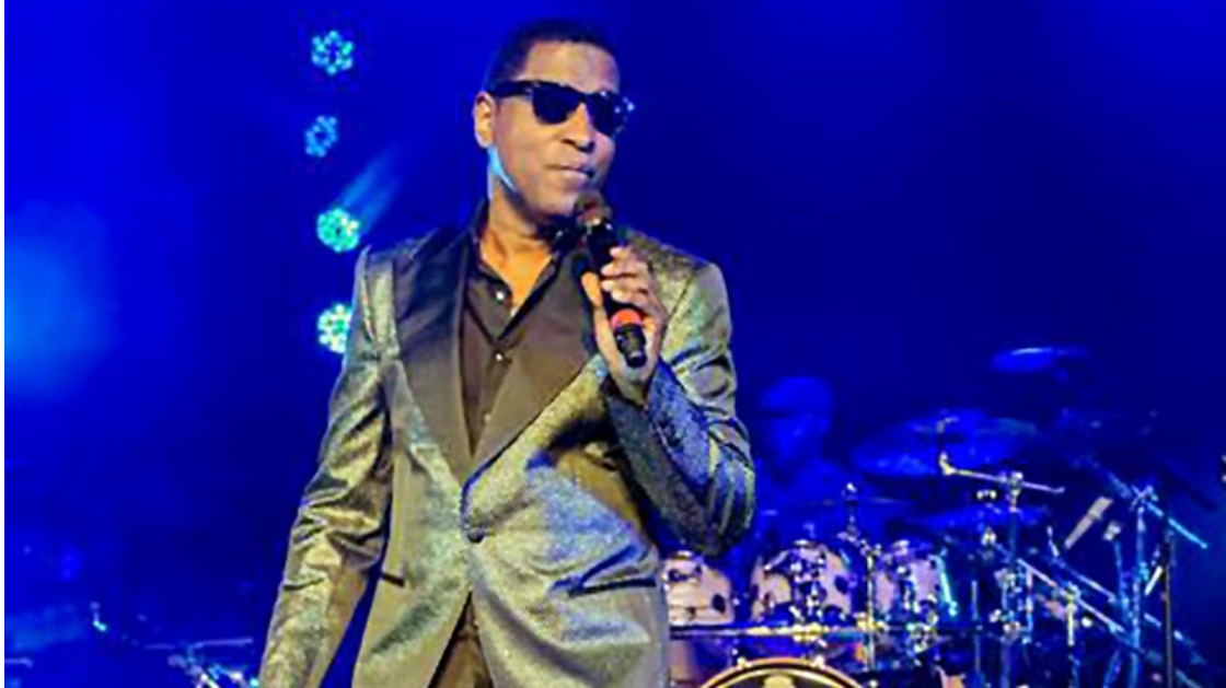
KENNY “BABYFACE” EDMONDS PERFORMS AT THE 2019 NEW ORLEANS UNCF MAYOR’S MASKED BALL

T he end of any year is always exciting, especially when the countdown is to the launch of UNCF’s 75 th anniversary year. And as the anniversary drew closer, the excitement spread from city to city, culminating in the March 15-16, 2019, weekend, when UNCF supporters in five cities—New Orleans, Birmingham, Milwaukee, Los Angeles and Raleigh—set off to have a good time for a great cause raising $2.8 million to help UNCF-member HBCUs move their students to and through college.