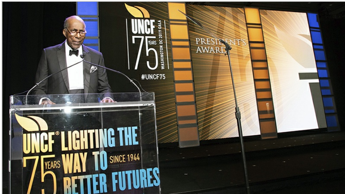
VERNON JORDAN ACCEPTS THE PRESIDENT'S AWARD DURING THE UNCF 75TH ANNIVERSARY GALA IN WASHINGTON, DC, IN MARCH 2019.