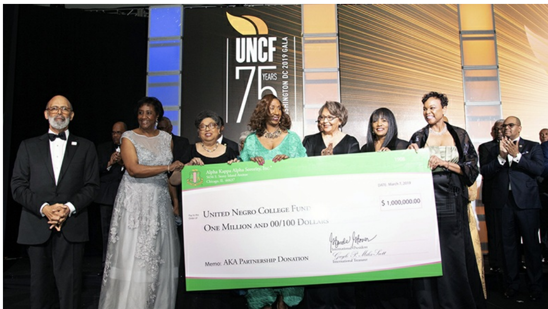
"A POWERFUL INVESTMENT IN BETTER FUTURES"

F or more than 40 years, the partnership of Alpha Kappa Alpha Sorority, Inc. (AKA), the nation's first African American sorority, and UNCF, America's first cooperative