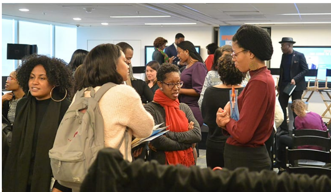
ATTENDEES DEBRIEFING ABOUT THE PANEL BEFORE THE KEYNOTE ADDRESS